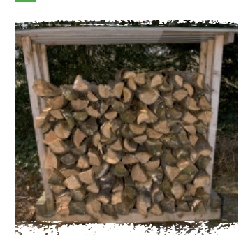
Stack for Summer (on bearers)