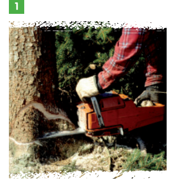
Fell by April (earlier for broadleaves)